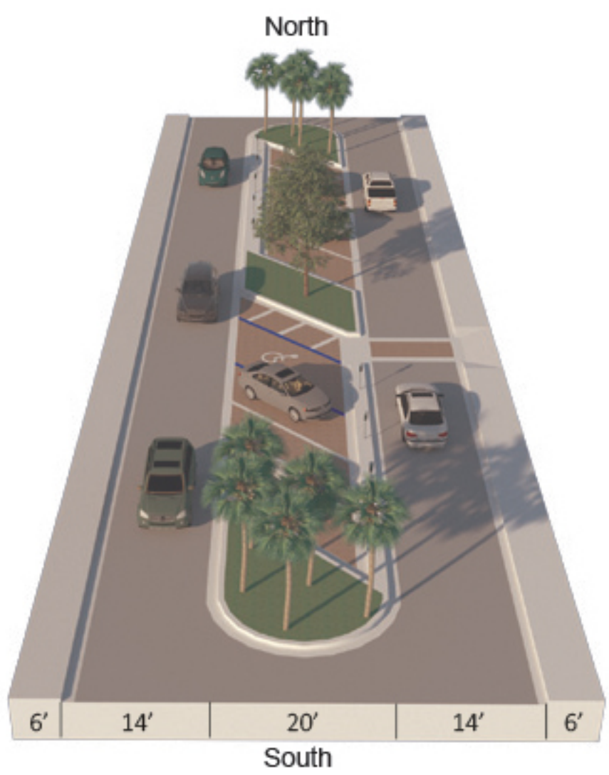
Existing Conditions Two-Way Street Central Diagonal Parking Island No Shade Trees Curbed

Breakers Avenue lies at the center of the North Beach district in Fort Lauderdale Beach. With the reinvigoration and personalization of Breakers Avenue's street design, it can not only increase the desirability of the North Beach District but also return breath life back into its artistic community. The new design of breakers Avenue will keep tourism, history, and the arts in mind to design a street that improves the existing transportation and infrastructure. The goal of the project is to make Breakers Avenue comfortable, connected, safe, and a memorable destination experience. Breakers Avenue will become a complete street that reduces the excess pavement, formalizes the seating and gathering spaces, and creates event spaces with the use of street trees, varied seating options, a unified material design, and a pedestrian friendly approach. The project team reviewed a series of documents and studies completed in the past five years to develop a better understand planning context and stakeholders' vision for Breakers Avenue. Breakers Avenue was conceptualized in a variety ways that balanced the desire for parking, public gathering space, future flexibility, and the pedestrian experience.